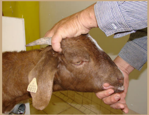
Position head so the neck is taut. Thumb is inserted in gap in teeth.