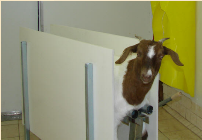
Animal remains calm, comfortable and curious throughout process.